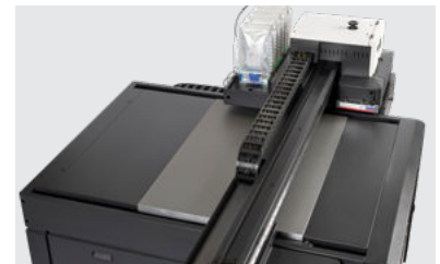
*From flatbed to integrated rotatory for cylindrical items